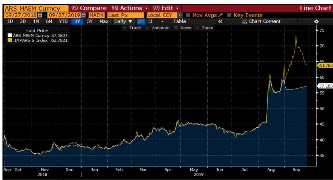
Chart showing both the ARS MAE Fixing and the Blue chip swap rate for the last several years

Please see chart below depicting the divergence of the official exchange rate and the "Blue Chip Swap" rate.