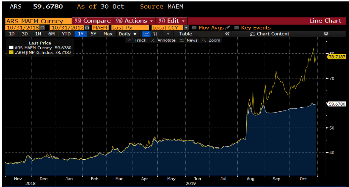
Chart showing more recent performance of the divergence in FX rates