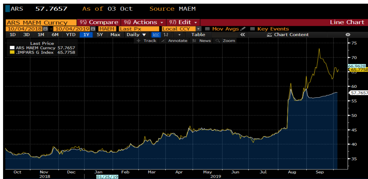
Chart showing both the ARS MAE Fixing and the Blue chip swap rate for the last several quarters

Please see chart below depicting the divergence of the official exchange rate and the "Blue Chip Swap" rate.